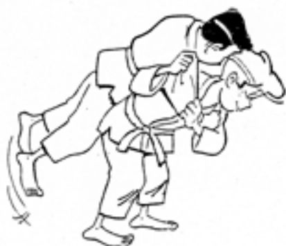
IPPON - SEOI - NAGE