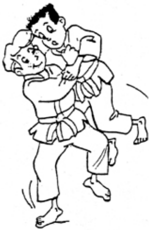
UTSURI - GOSHI