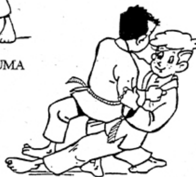
TANI - OTOSHI -