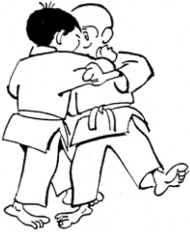
KO - SOTO - GAKE