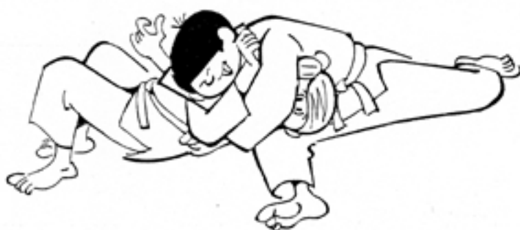
MAKURA - GESA - GATAME