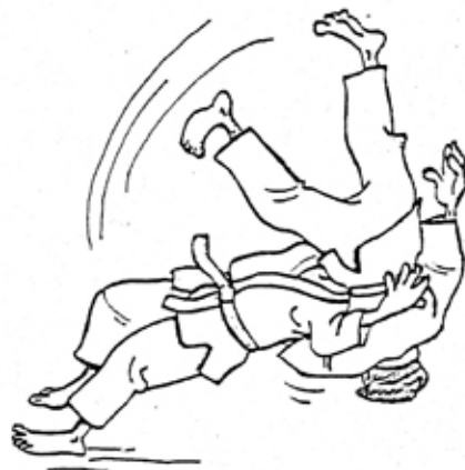
URA - NAGE