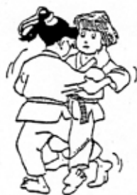
O - UCHI - GARI