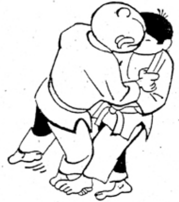
OKURI - ASHI - BARAI