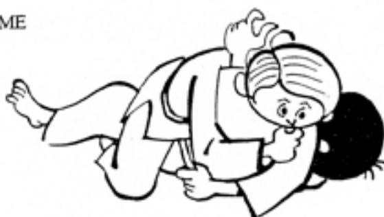
KUZURE - TATE - SHIHO - GATAME