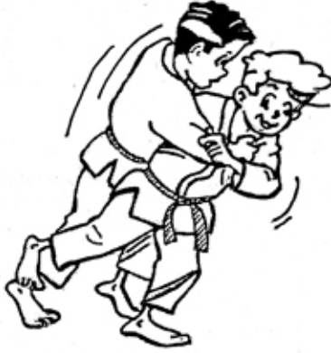
HARAI - GOSHI