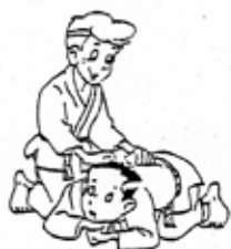
YOKO - SHIHO - GATAME