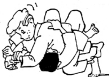
UDE - GARAMI