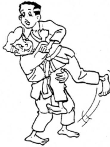
TE - GURUMA