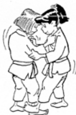
DE - ASHI - BARAI