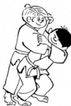
TSURI - KOMI - GOSHI