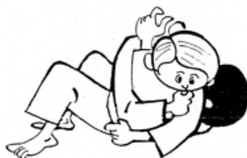
KUZURE - YOKO - SHIHO - GATAME