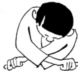
POSITION DES BRAS