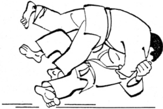
UKI - WAZA